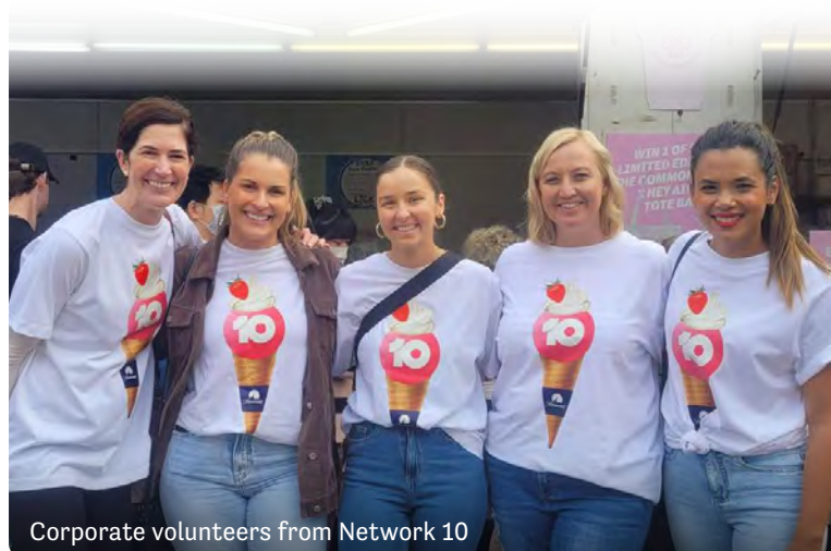
Corporate volunteers from Network 10

*If these numbers are not met, additional volunteers will be added to your shift by The Common Good to ensure smooth operations.